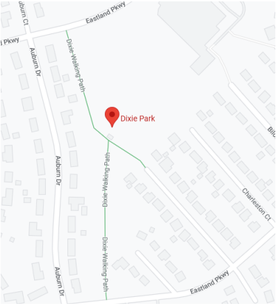
1850 Eastland Pkwy, Lexington, KY 40505